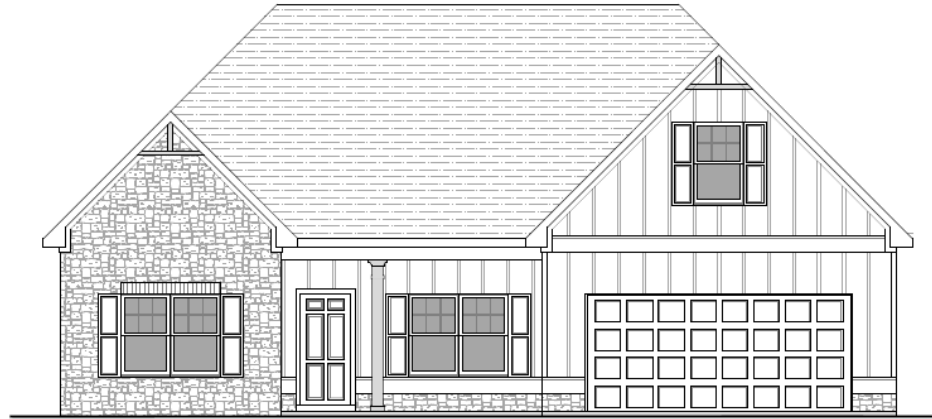
The Lexington-Elevation BSR2 4 BEDROOMS, 2 BATHS