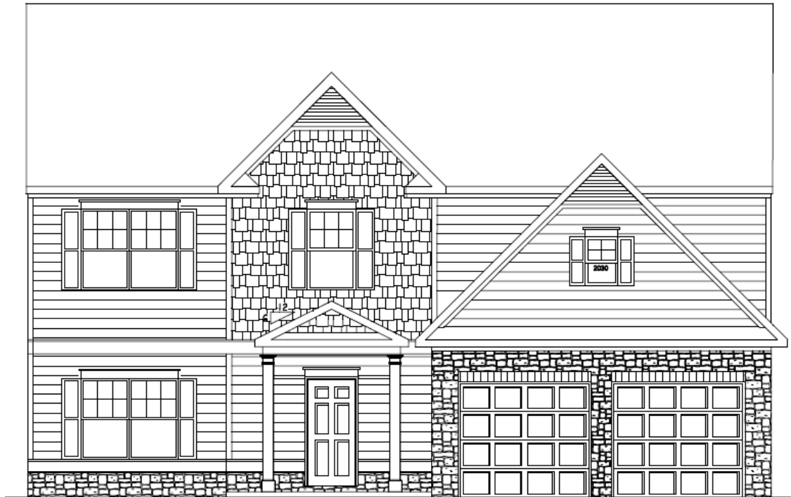
THE REYNOLDS - ELEVATION ASR3