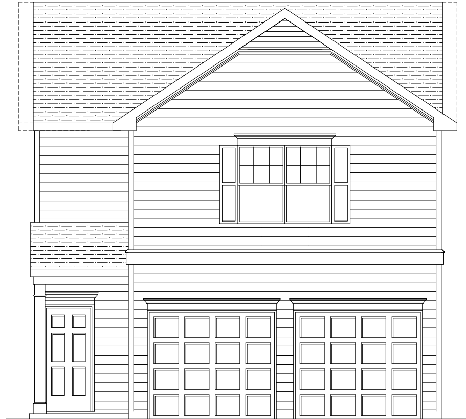
The Parker-Elevation BS1