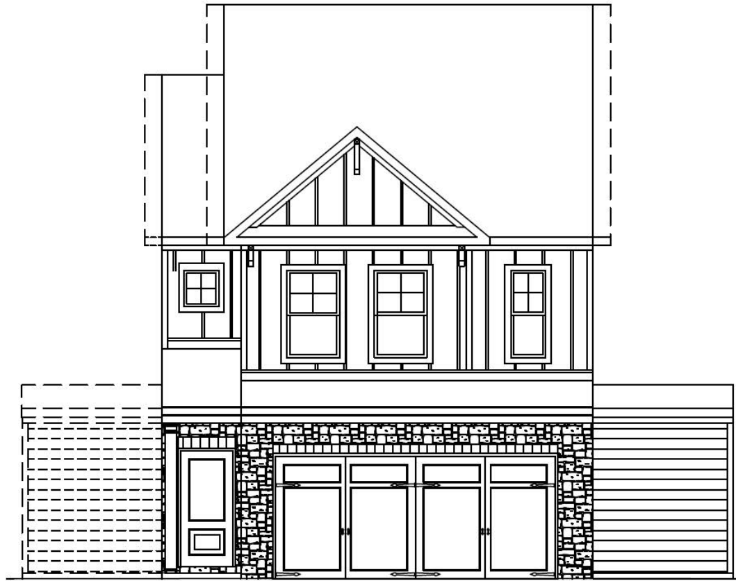
The Columbia-Elevation ASR4